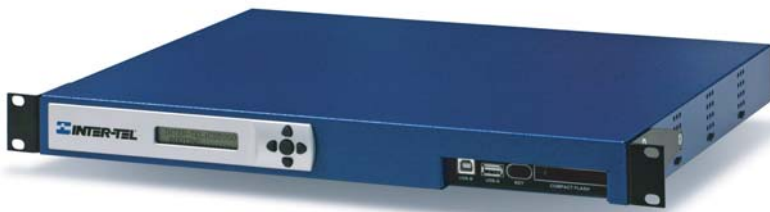
Call recording with fast search facility - Single-click playback enables you to find a required recording quickly and easily