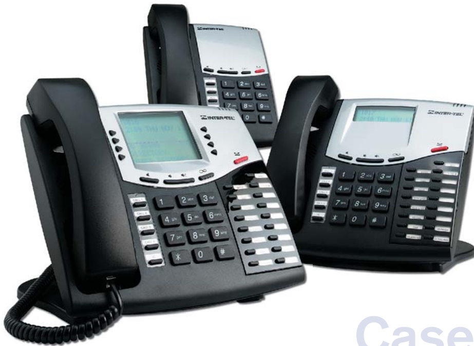
S8000 Series Multiprotocol VoIP Endpoints from Inter-Tel